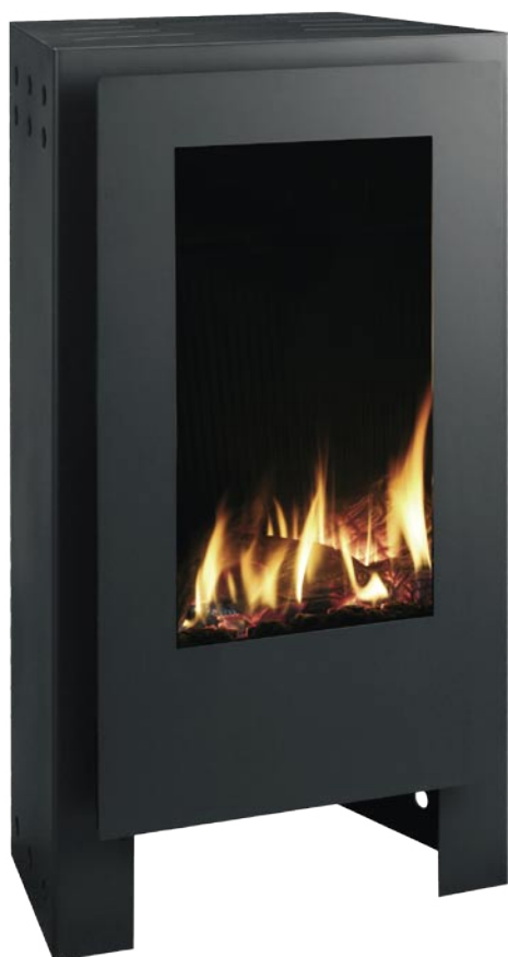
FH34 - Graphite